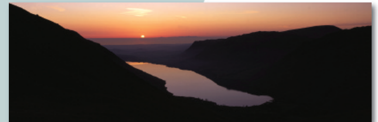
End of the day. The sun sets over Wast Water seen from the slopes of Scafell.