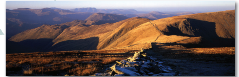
High Street. A broken wall leads the eye north along the flanks of High Street towards the Straits of Riggindale, with Blencathra visible on the distant skyline.