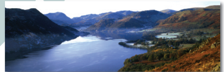
Ullswater. Gowbarrow Fell provides a wonderful viewpoint for this autumnal scene along a misty Ullswater to Glenridding.