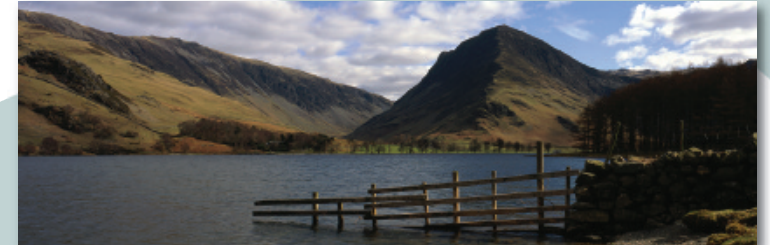
Shapely peak. A fence leads the eye across Buttermere to the pyramid-shaped Fleetwith Pike which dominates the head of the valley.