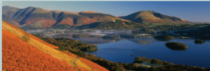
Autumn colours. The lower slopes of Cat Bells provide a stunning viewpoint for this autumn scene across the northern reaches of Derwent Water to the Skiddaw massif, with Blencathra to the right, and forming a backdrop to Keswick.