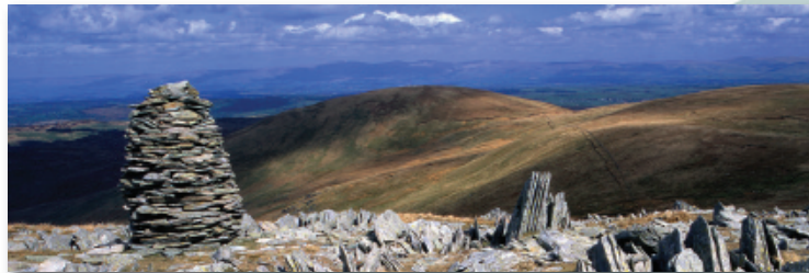
A view from the crag. A shapely cairn acts as a foreground for this view from Artlecrag Pike towards the grassy Selside Pike overlooking Haweswater.